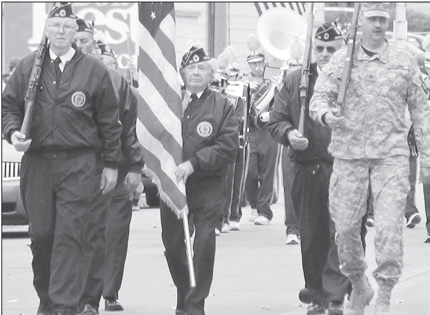
The color guard marched through downtown Norton during the Annual Veterans Day Parade. There were an estimated 120 entries in the parade with many Norton County veterans participating.