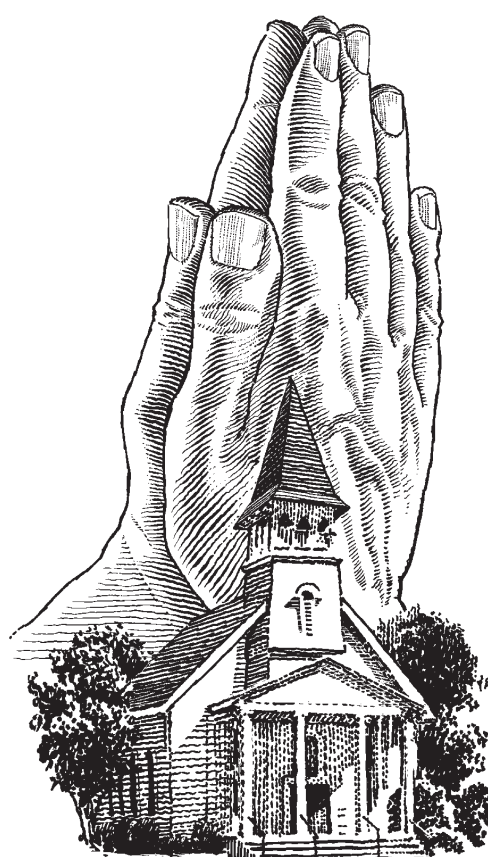
SUNDAY — 10:30 a.m. Morning Worship