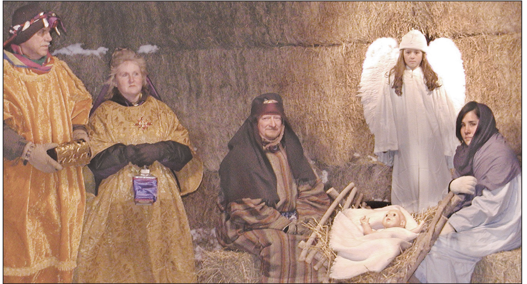
The First United Methodist Church held their annual live nativity from 6-8 p.m. on Sunday. The event had been delayed a week due to a snow storm last Sunday. Despite the cold, many residents turned out to view the nativity, although many did so from inside their vehicles.