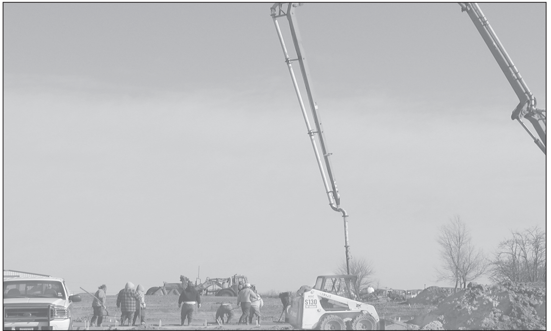
Construction of the new Dollar General store has started with concrete being poured this week. The new store will be located on east Highway 36 where R&M Motel used to be located. The motel was demolished

several weeks ago to make way for the new store.