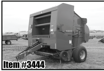
Item #3440 '02 Gleaner R-62 combine Item #3444 '07 Agco 5456A round baler

'07 Hesston 5556A, '07 Agco 5456A, '05 Hesston 956A, '05 Hesston 4910, '05 Case IH WDX1202, '02 Gleaner R-62, '02 Hesston 4790, '98 John Deere 1750 MaxEmergePlus, '98 DMI Tigermate II, '95 John Deere 8770 4WD, '93 Ag-Chem RoGator 664, '93 Ford 8830 MFWD, Krause 2408 double offset disc, Sunflower G4 four section tandem disc, and more