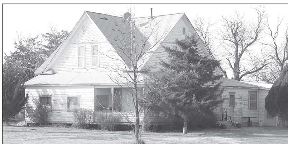
5 Bedroom Home with 1 Bath and Large Entertainment Room