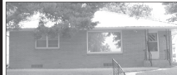
405 N. Brown - Bigger than it looks! Full Basement, Detached Garage, Move-in Condition!