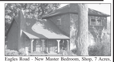
Eagles Road - New Master Bedroom, Shop, 7 Acres, Country Living