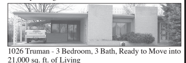
1026 Truman - 3 Bedroom, 3 Bath, Ready to Move into 21,000 sq. ft. of Living