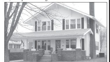
606 N. First - 2 Story, 4 Bedroom, New Kitchen, Central Location