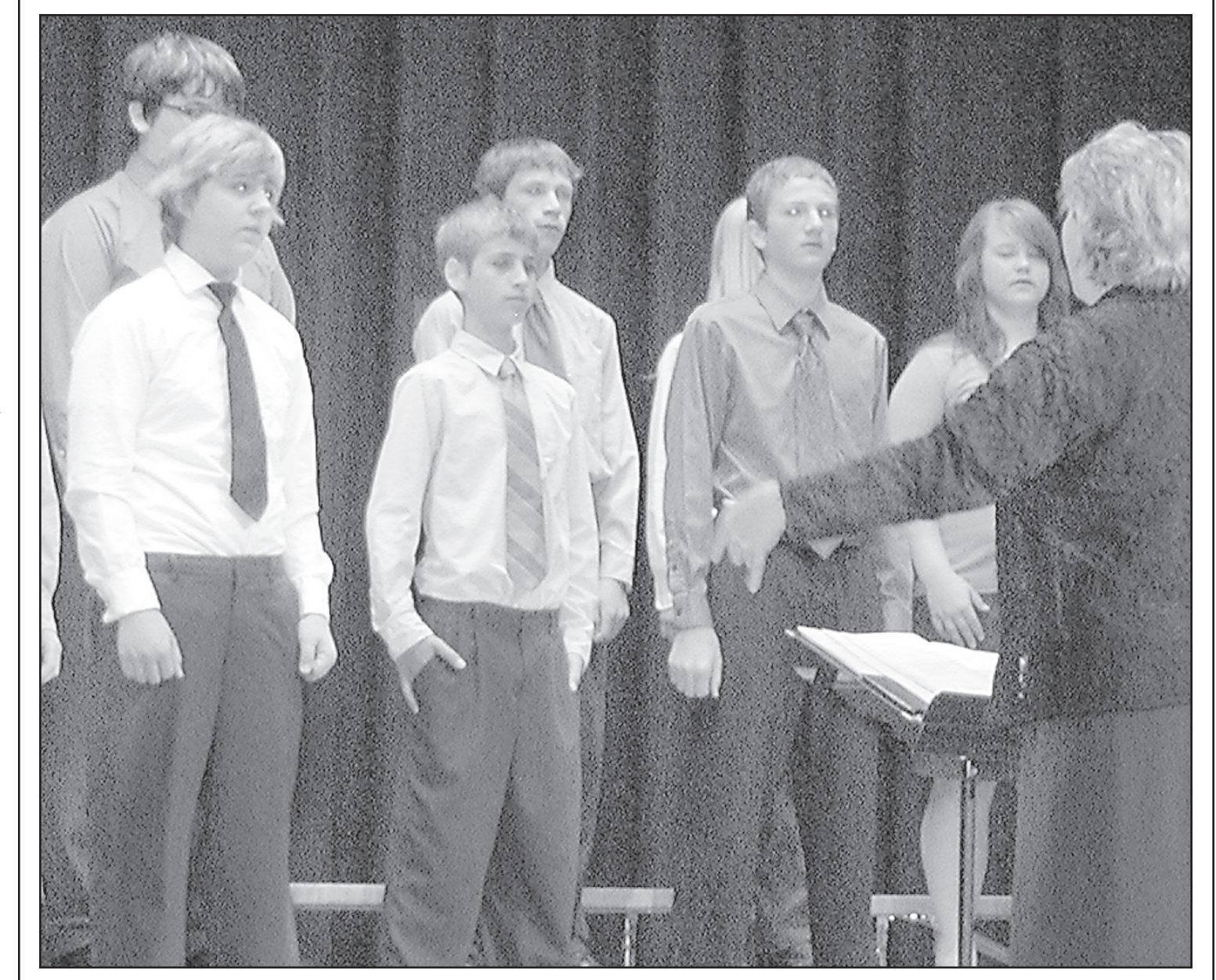
The Norton Junior High School choir participted in the Let's formed various dances and songs during the concert. Celebrate Music performance at East Campus on May 7. The high school, junior high school and Jay Singers per-