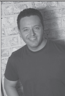
John Edward Internationally respected

Overland Park Conv. Ctr. 6000 College Boulevard Overland Park, KS