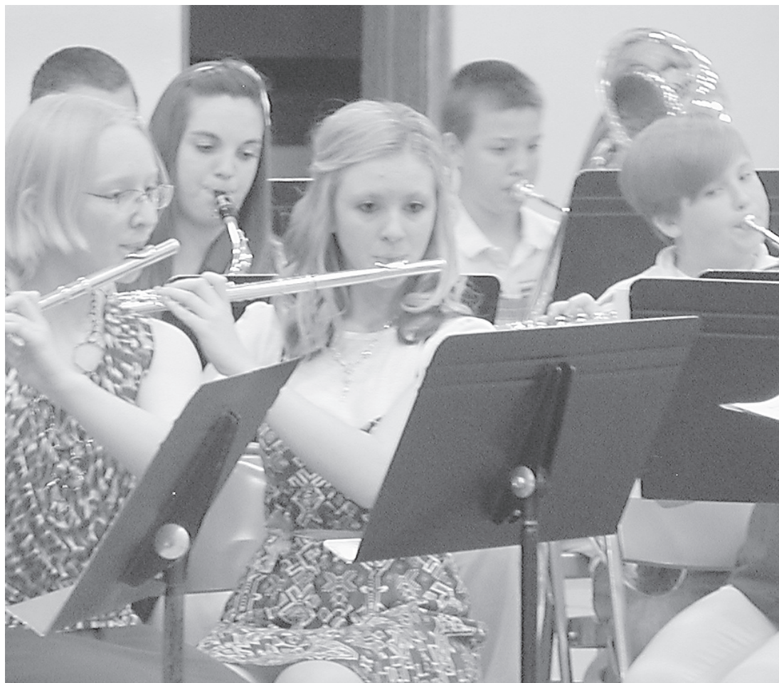
The Norton Junior High School band held a concert May 13 after the annual exhibit night. The concert began at 7:30 in the junior high school gym.