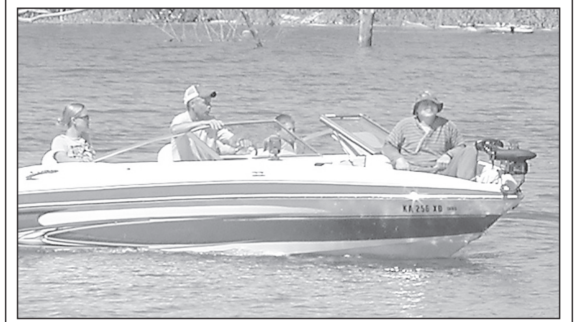
People took advantage of the free weekend at Prairie Dog State Park to fish and take their boats out on the lake. The summer fishing season officially kicked off over Memorial weekend.