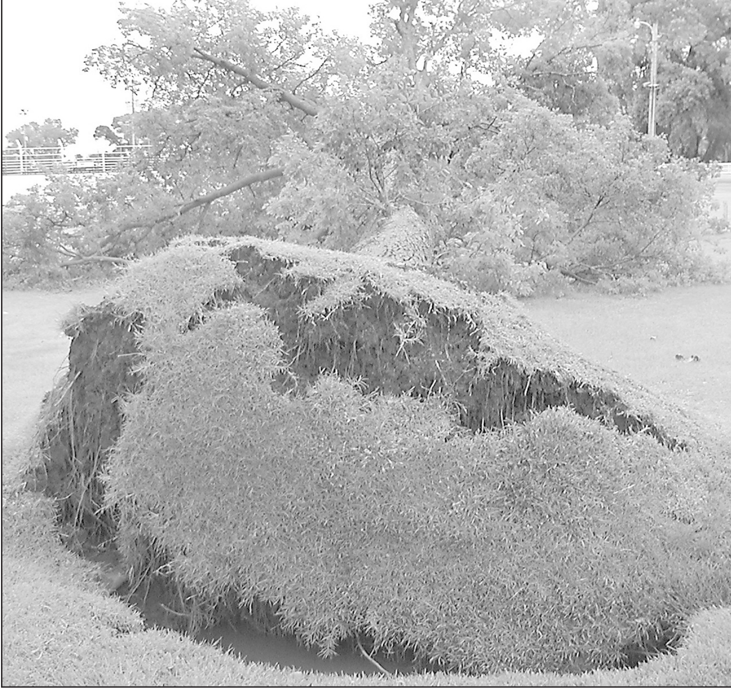
Mother Nature's wrath was apparent this weekend when over 4 inches of rain fell between Saturday and Monday morning. The rain brought high wind, which caused damage to areas around town. In Elmwood Park (above) a