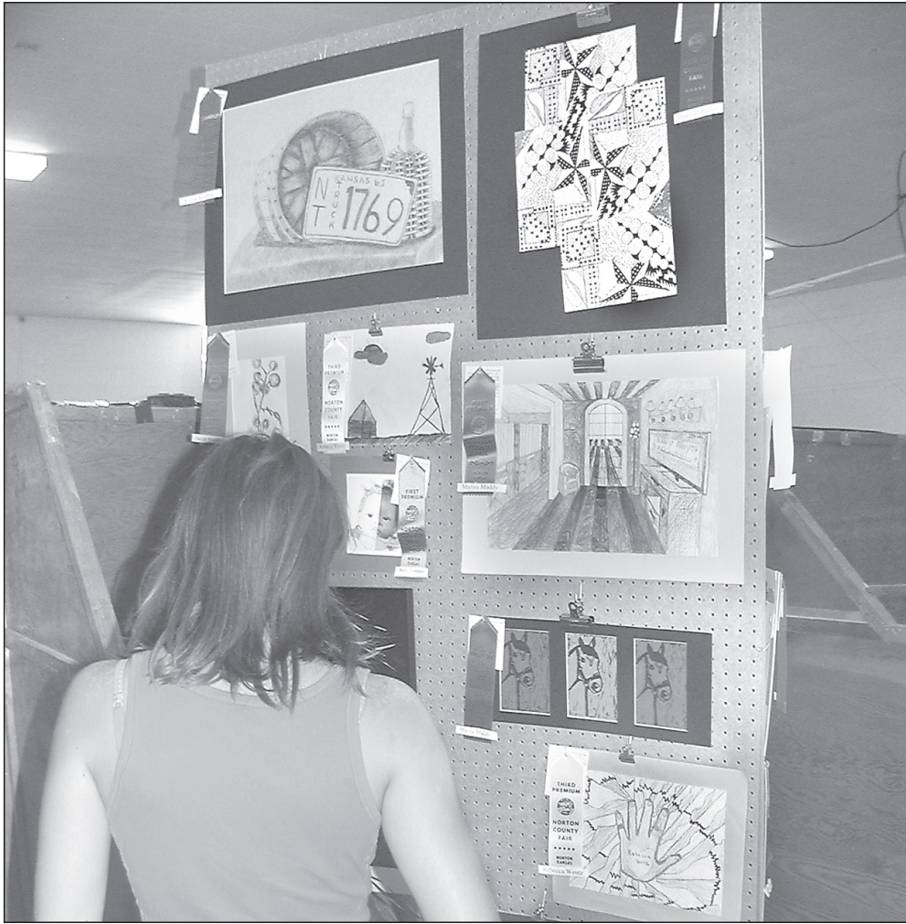
Spectators enjoy the art exhibits at the 4-H Building.