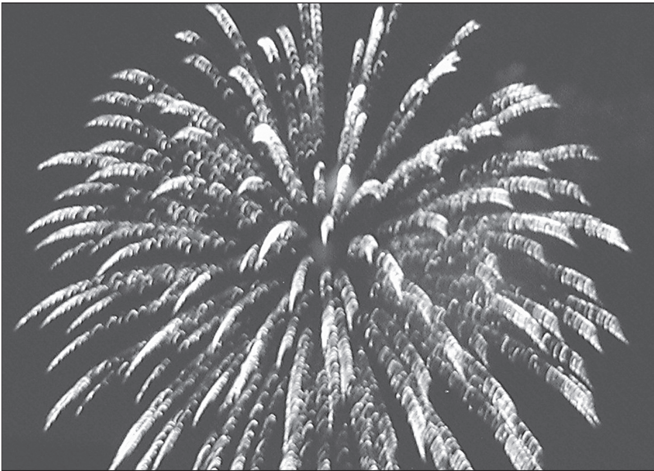
The Fourth of July fireworks display was a huge success at Prairie Dog State Park. A record number of vehicles entered the park for the holiday.