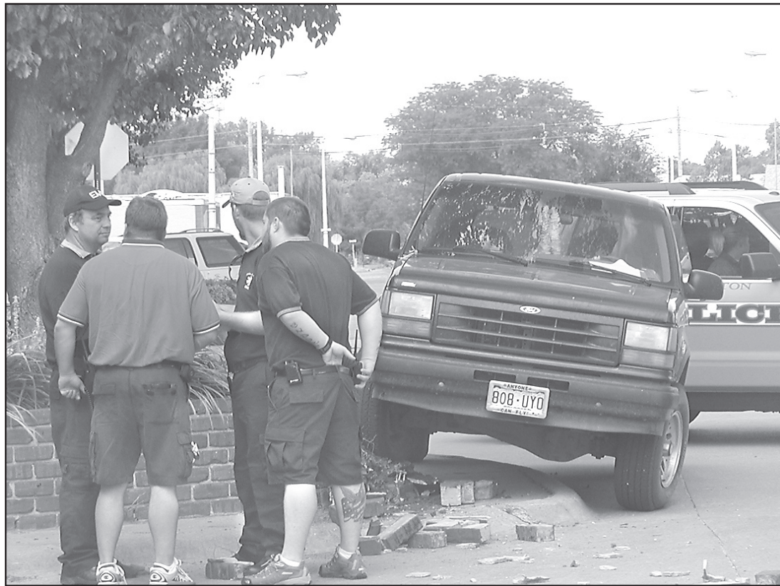
A downtown planter appears to be the subject of discussion between the members of the Emergency Medical Services. The driver of the vehicle was not injured after striking the planter in an accident on July 30.