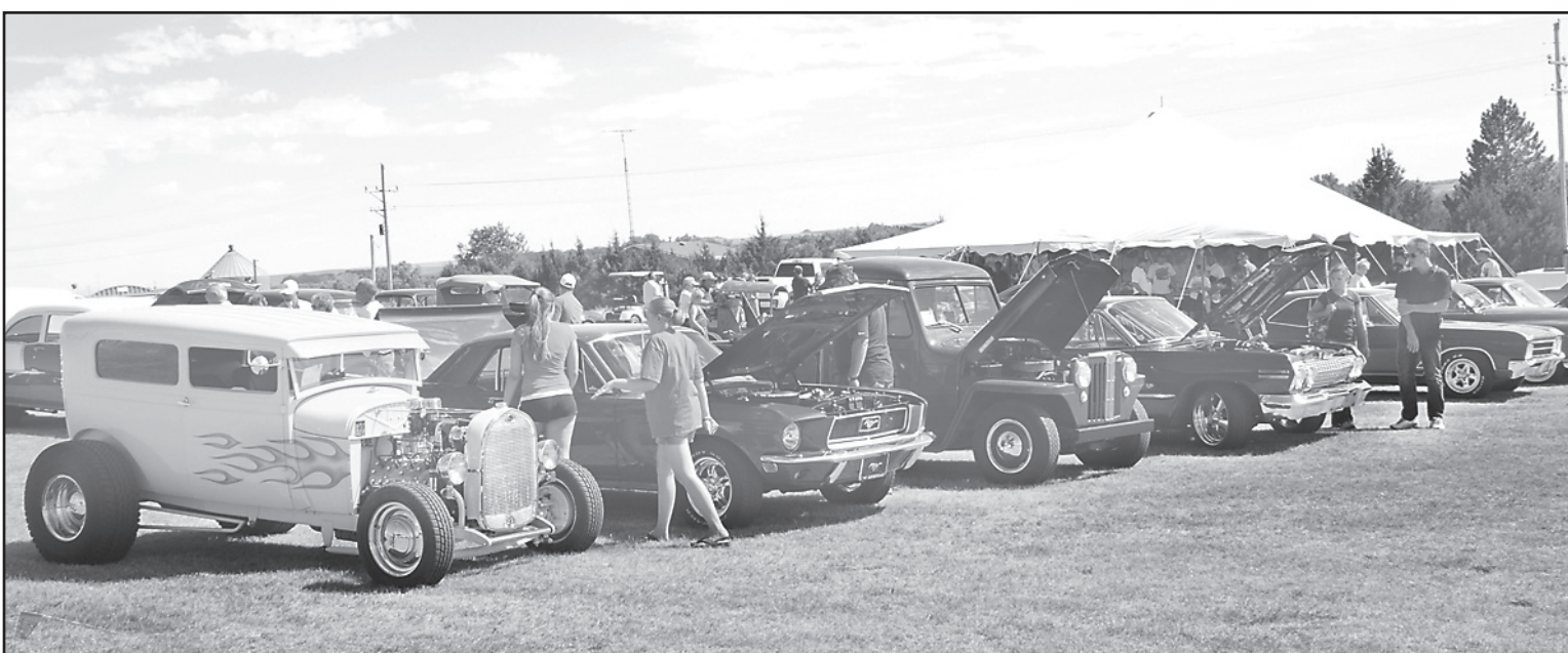
The 16th annual Dane G. Bales Jr. Memorial Car Show was held during the 34th annual Logan Labor Day Celebration

County Road 430 6 miles Norton and 1.5 miles West of Jennings. The accident was investigated by the Kansas Highway Patrol.