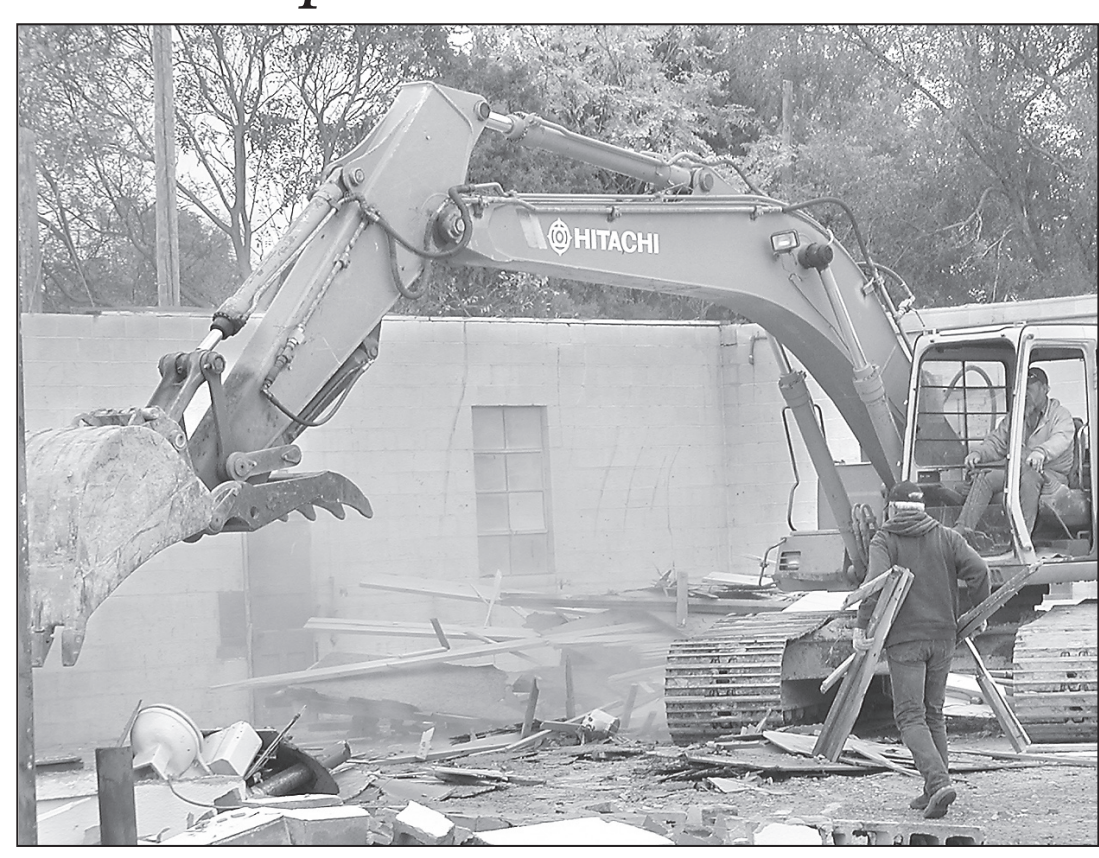
A crew working for Whitney Construction and Farms Inc. brought in heavy equipment Monday to demolish the former Kansasland Tire building. The property is being cleared to make way for a new hotel.