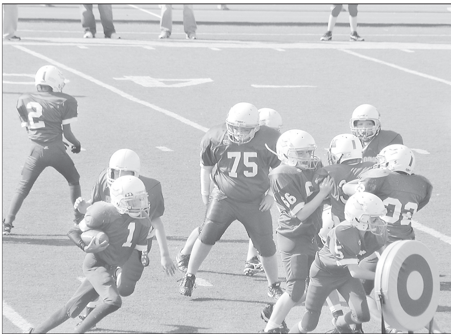
Norton's Sixth Grade Junior Jays played hard against the McPherson Bull Pups at Fort Hays State University stadium in the Western Kansas Football League Tournament of Cham-