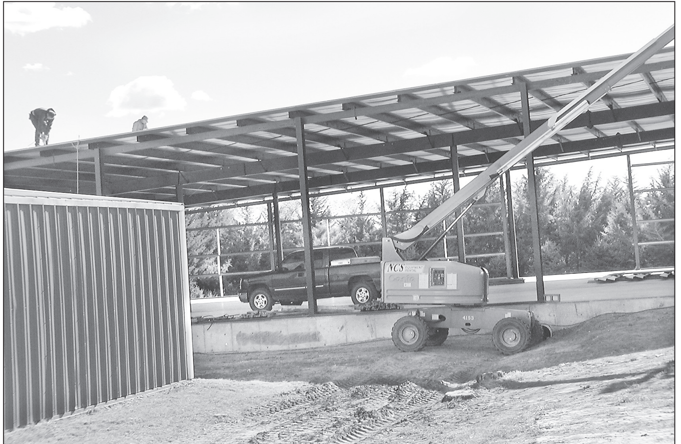
Construction on the 30,000 square foot addition at the Natoma Corporation, begun in May, should be complete at the end of the year. Until the interior is fitted for manufacturing, the building will be used for storage.

Natoma received a similar loan ten Addition - Continued on Page 5)