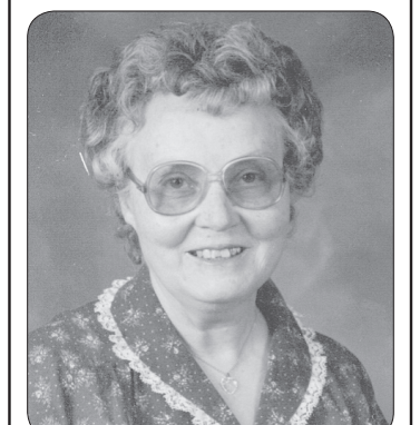
JANUARY 22, 1923- DECEMBER 16, 2005