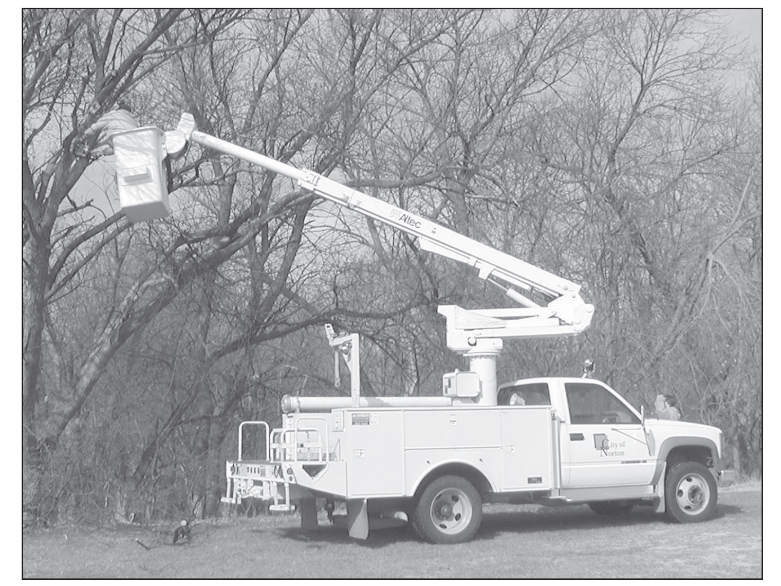
The T-Ball field is becoming a reality. Norton City crews have started trimming the overhanging tree branches on Robinson Creek as the first step in preparing the area. The field will be on the south side of Ward Field. The City council approved the request for a T-Ball field by the Norton Recreation Commission in July 2010.