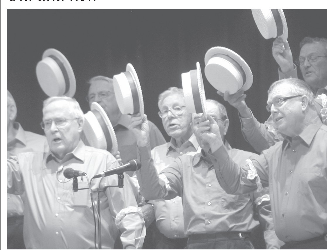
The Norton County Arts Council presented an evening of Barbershop, "Then and Now," Saturday night. It featured the Prairie Statesmen Chorus from McCook and The Habitat 4 Harmony Quartet from Kearney.