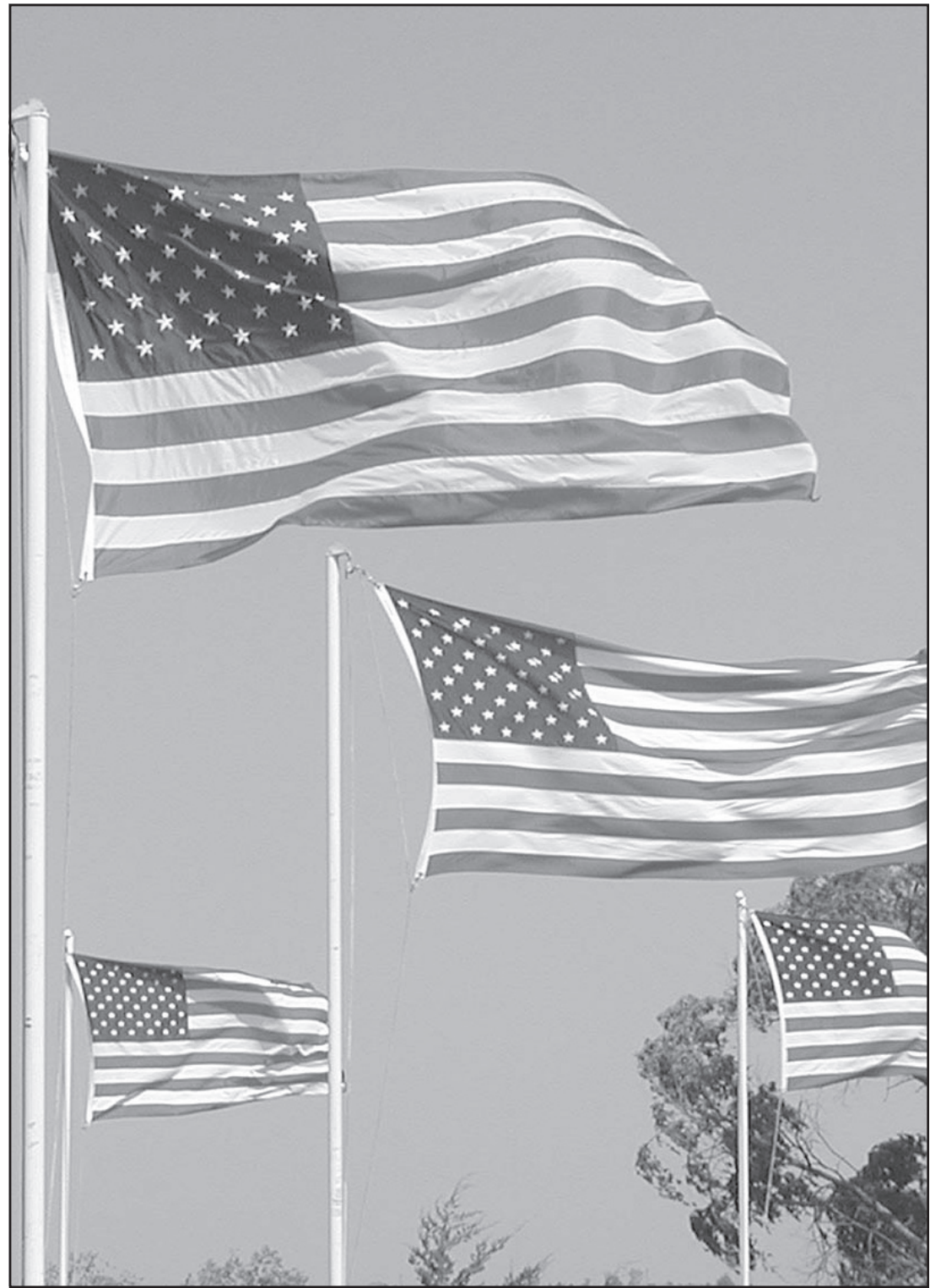
The flags flying at the Beaver City, Mount Hope Cemetery were whipped wildly in the wind Monday at the Memorial Days Services. A large crowd gathered to show their respects and the events concluded with the Nebraska Artillery firing of the cannon.