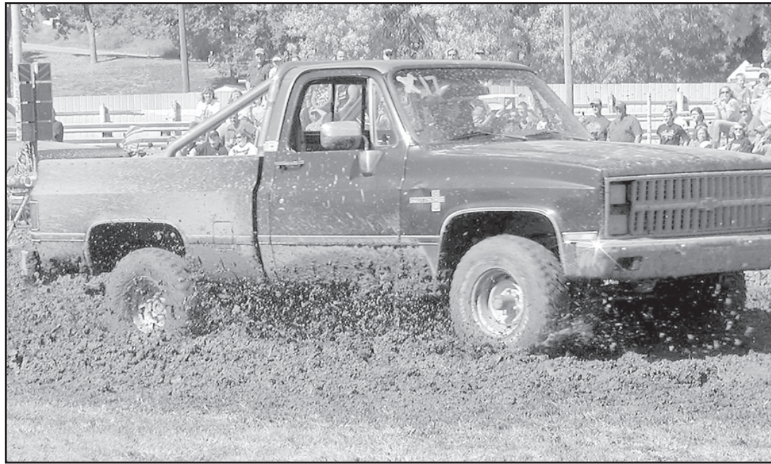
A competitor makes mud fly at the Elmwood Park Speedway Saturday afternoon during mud-drag races. Sponsored by the Custer County Mud Draggers, the event featured trucks of all kinds, trying to speed through mud and water and make mud fly.

About 30 racers and hundreds of spectators gathered at the Elmwood Park Speedway Saturday afternoon for the mud-drag races at the track. Sponsored by the Custer County Mud Draggers, proceeds from the event go to support the Norton Rural Fire Department and the Jacob Gallentine Memorial Scholarship Fund. The results of the races are as follows: