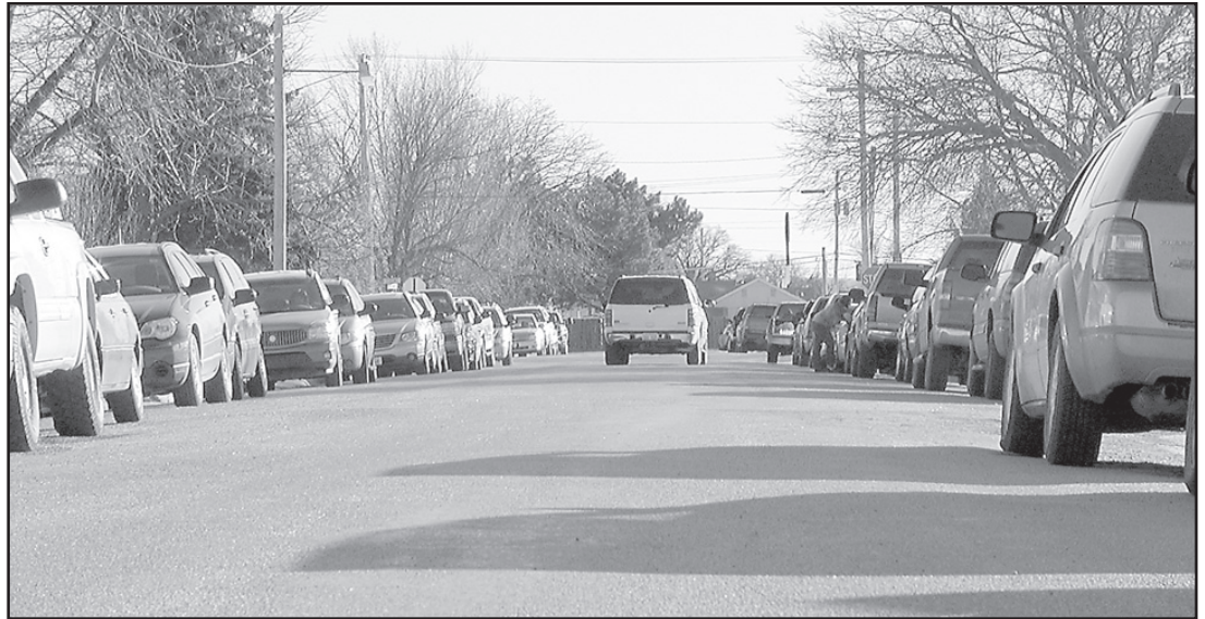
Gloria Cole of Norton approached the Norton City Council Wednesday evening to discuss parking problems along Eisenhower Drive, especially on school days. Though traffic congestion on the street wasn't as heavy as usual Thursday afternoon, cars still lined both sides of the street after school.

at the school, especially during pick-up and drop-off times at the school. While no decisions were made on the matter, the council agreed to consider possible solutions to traffic problems, including possibly restricting parking during certain times of the day on Eisenhower Drive and around the school.