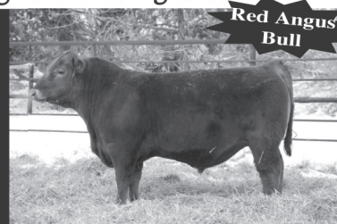
Y107 RAILE 6675 V153 X RAILE RUTH V034 0.8, 39, 72, 19, 692 / 106, 1352 / 107

Sale will be broadcast live on DV Auction.