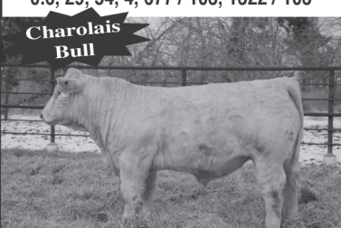
Y053 2250 X SUPER CHARILE 1.4, 24, 42, 16, 669 / 102, 1240 / 97