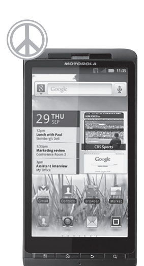
Motorola Milestone X2

Norton • 117 North Norton 785-877-4135 • Toll Free: 877-550-7872