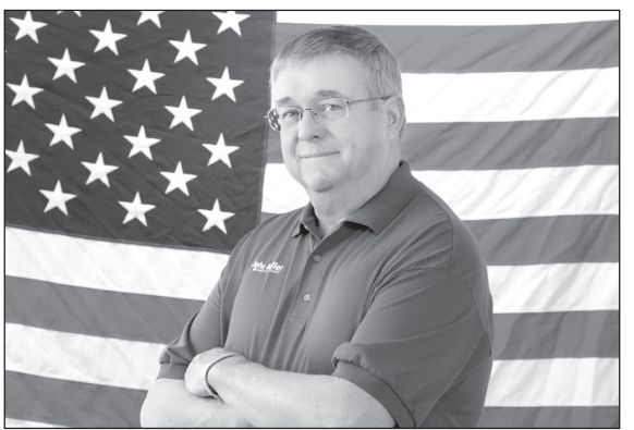
Farmer and Small Businessman. Public Servant. Proven Leader. "Speaking up for YOU