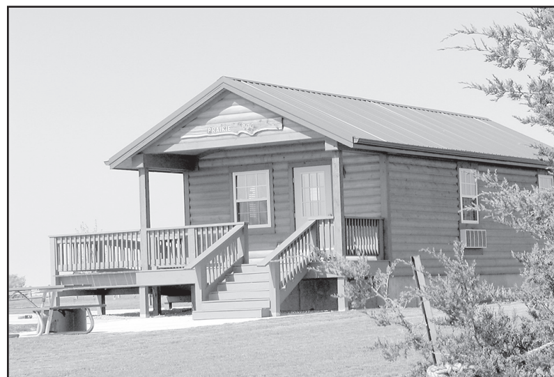
Prairie Dog Cabin