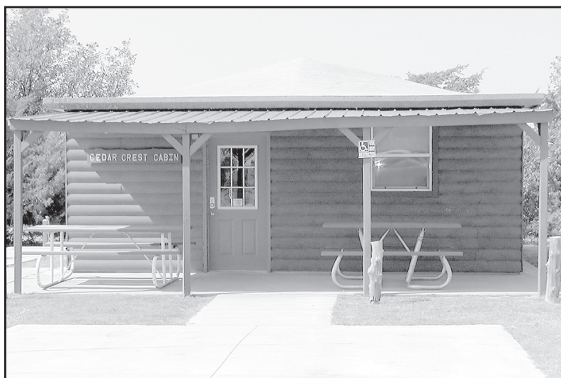
Cedar Crest Cabin