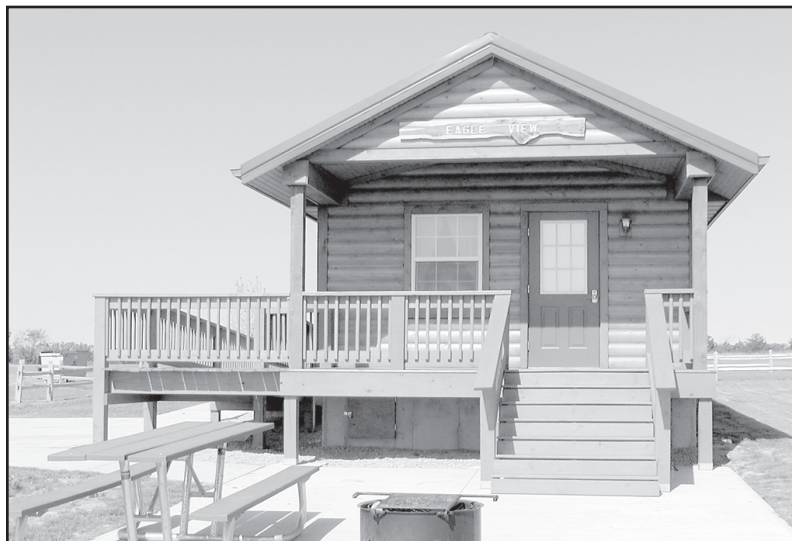
Eagle View Cabin

Anyone interesting in reserving a cabin a rental can visit www.reserveamerica.com