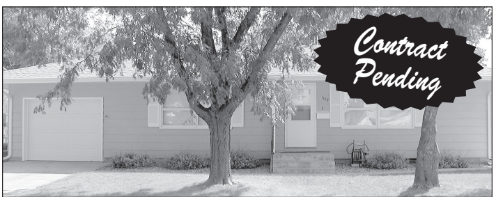
1109 Nixon - Norton, Kansas