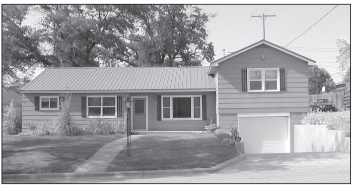
707 West Wilton - Norton, Kansas