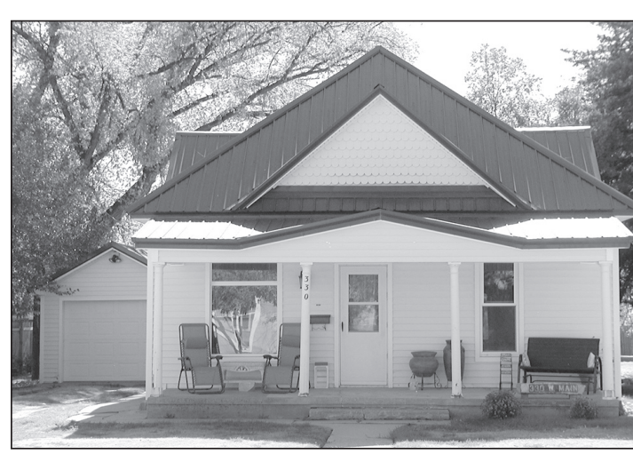
330 W. Main - Norton, Kansas