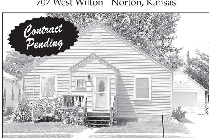
604 North Jones - Norton, Kansas