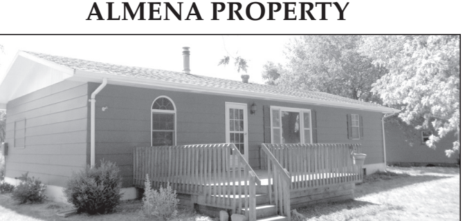
401 Ives Street - Almena, Kansas