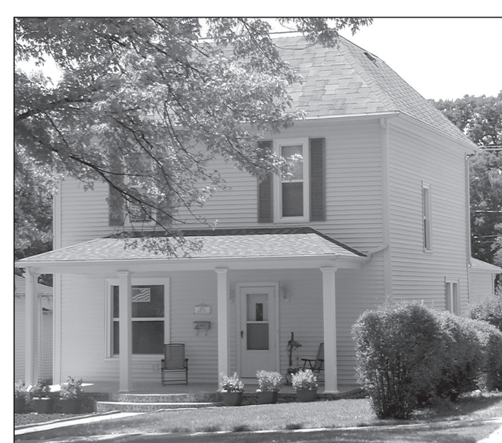
408 North First - Norton, Kansas