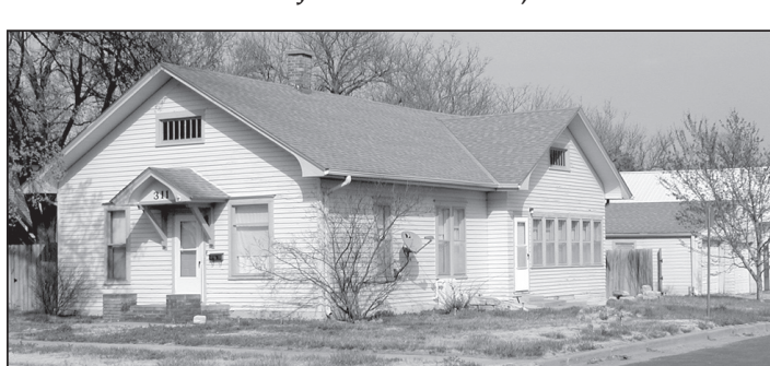
311 S. Kansas Avenue - Norton, Kansas