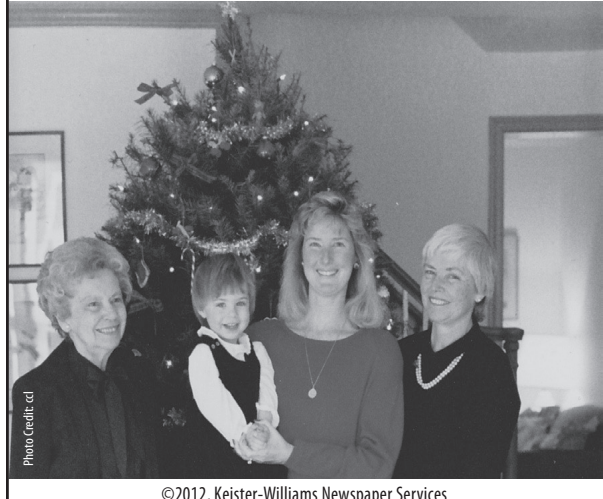
P.O. Box 8187, Charlottesville, VA 22906, www.kwnews.com

generations to share wisdom with the younger is