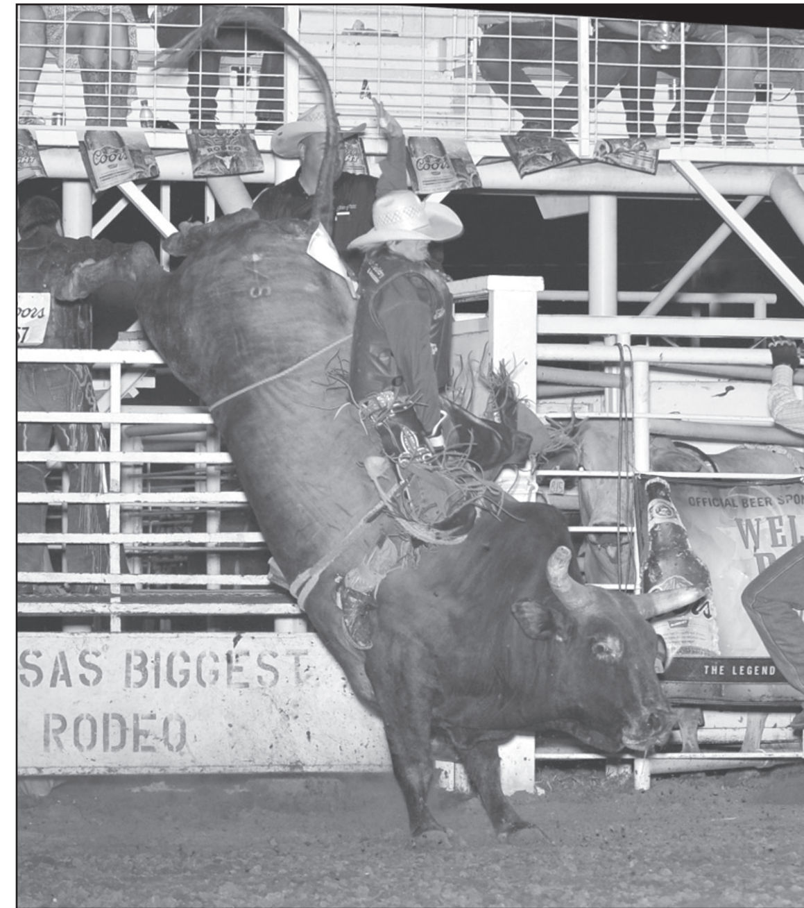
Kansas Biggest Rodeo in Phillipsburg attracts thousands of fans and hundreds of cowboys, cowgirls, horses, and bulls to town. This year's 84th annual event is August 1-3.

He is going to do when we get there. It's sometimes a tough lesson to learn, but totally worth it in the end! The group is very grateful for the people of this community and the surrounding areas. Many of them supported teens with financial gifts which are the only way these trips are possible.