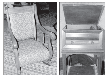
Oak Rocker, Nice