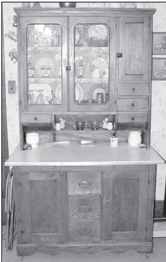
Large Kitchen Cabinet with Top