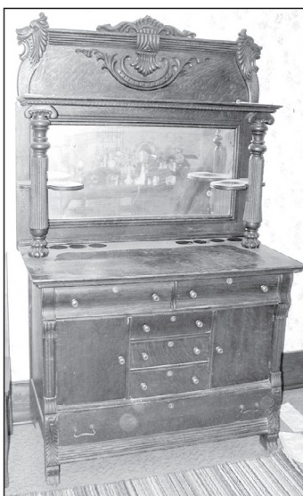
Buffet, Ornate with Large Mirror