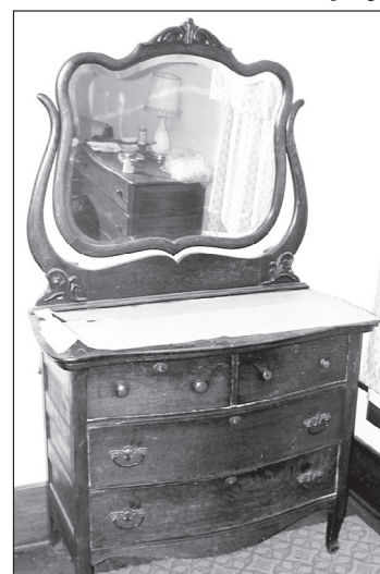
Oak Dressers and Mirrors