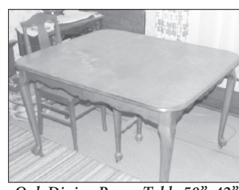
Oak Dining Room Table 50"x42"