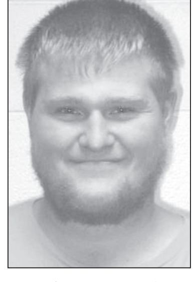
Favorite Hang out: My house. Personal Hero: Parents

Future Plans: Go to FHSU, graduate and try to become a professional tattoo artist