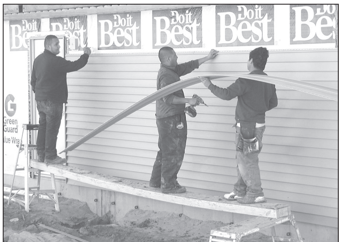
Bainter Construction of Hoxie has been busy working on the Norton Estates located at Crane and Reagan of Norton. Contractors are seen here putting the siding on the first four buildings which will have two living units each. By the time construction is completed there will be 12 buildings with 24 living units.