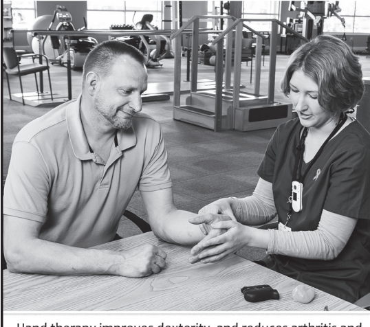
Hand therapy improves dexterity, and reduces arthritis and carpal tunnel pain.

Our Occupational Therapists can help you