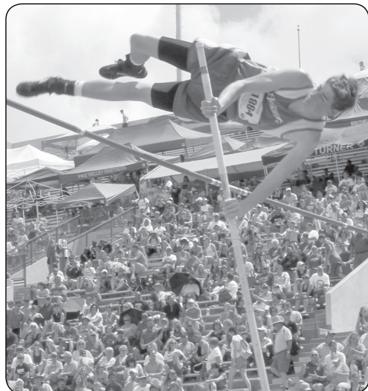
Northern Valley junior Clint Cole set a personal record of 12'6" to place fifth in the Class 1A pole vault during the State Track and Field Meet.