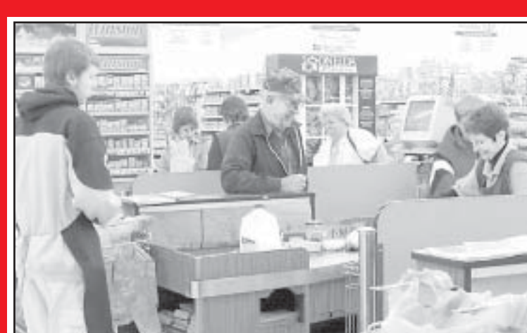
Norton Shop and Save

505 W. HOLME, NORTON-785-877-2133; TOLL FREE 866-249-7804