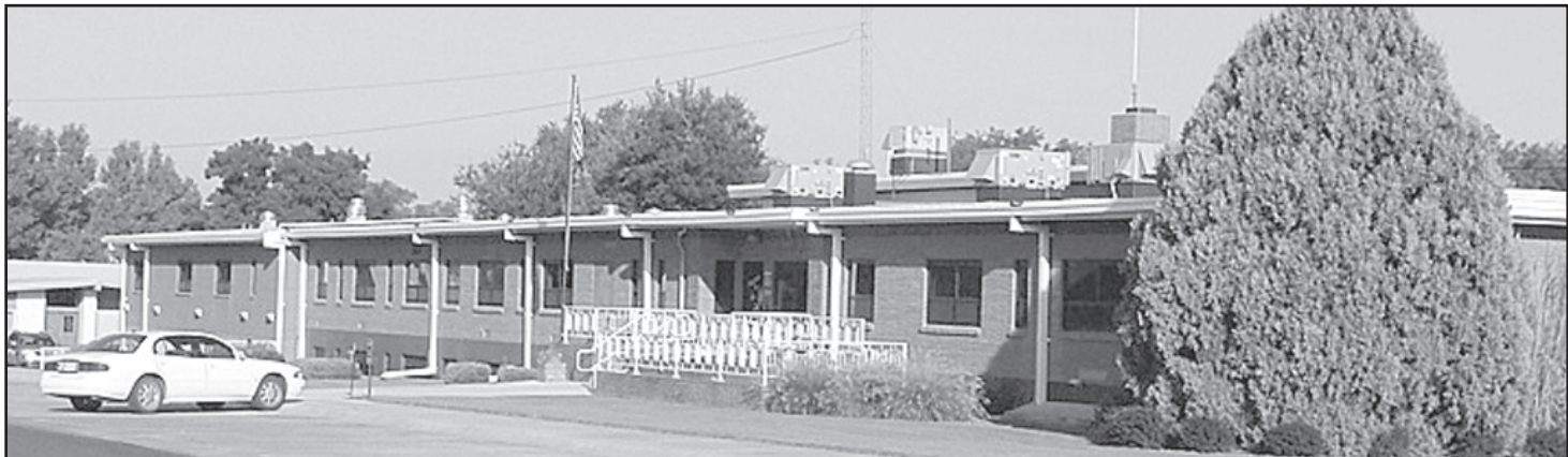
Cheyenne County Hospital