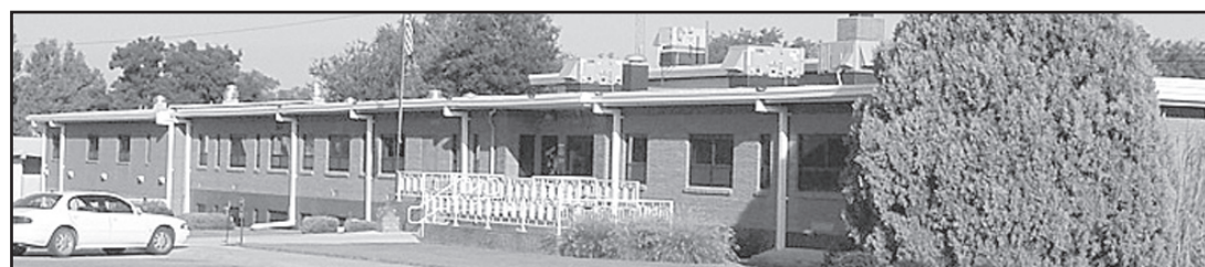
Cheyenne County Hospital