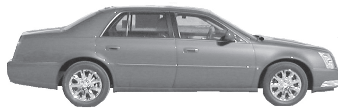
2009 Cadillac DTS, Crystal Red