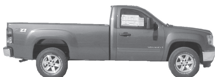
2009 GMC Reg Cab, Stealth Gray

Do you Currently Own A 99 Or Newer GM? If So at Vince's GM Center You Can Get Up To $3000.00 Off A New 2008 Or 2009 GM Vehicle As A Loyalty Customer plus Up To $4500.00 Consumer Cash On Select Models.