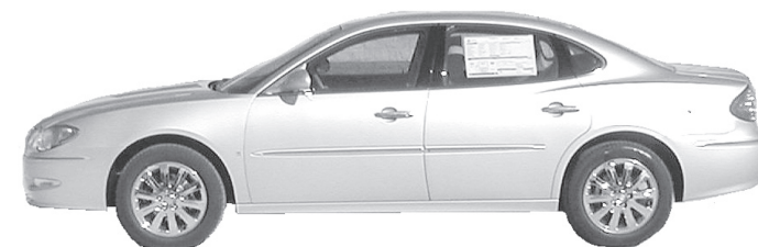
2009 Buick Lacrosse, Silver