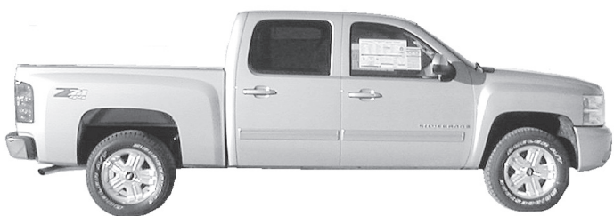
2009 Chevy 1/2 Ton Crew Cab, Silver