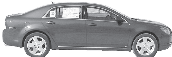
2009 Chevy Malibu, Red Jewel Met.