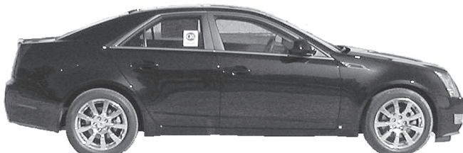
2009 Cadillac CTS, Black Ice