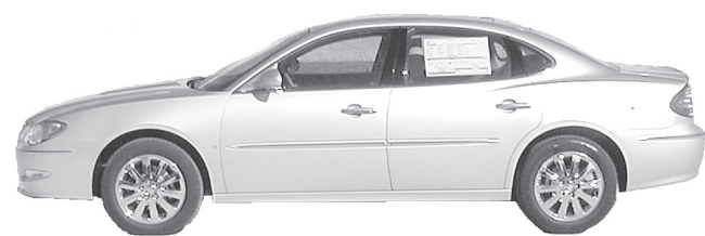
2009 Buick LaCrosse, White

The President's Sale Is Going On Now Til March 2 At Vince's Gm Center. We Have 0% Apr For 60 Months (W.A.C) or Rebates Up To $4500.00 On Select Models.