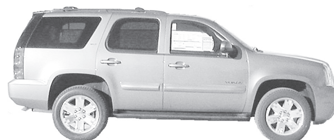
2009 GMC Yukon, Steel Gray