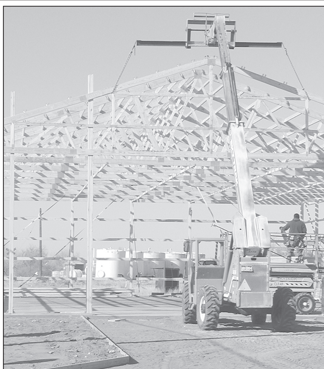
SHED RAISING — The new St. Francis Equity Feed store building is quickly going up on River and Jackson streets.

The next meeting is set for Wednesday, April 8, but will begin at 7:30 instead of 8 p.m. as stated on the school calendar.