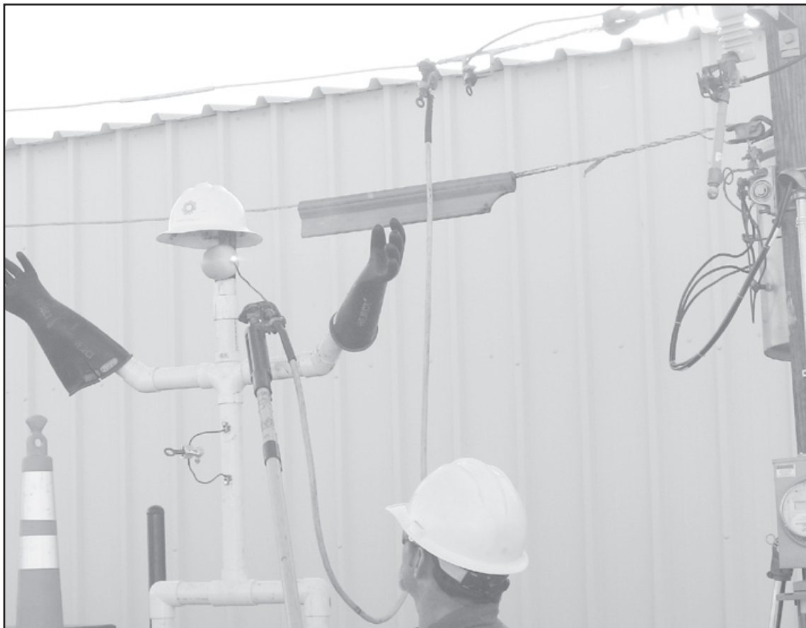
THE DANGER OF electricity is one of the areas of concern when it comes to farm safety. A Midwest Energy employee demonstrates the power of high wire lines.