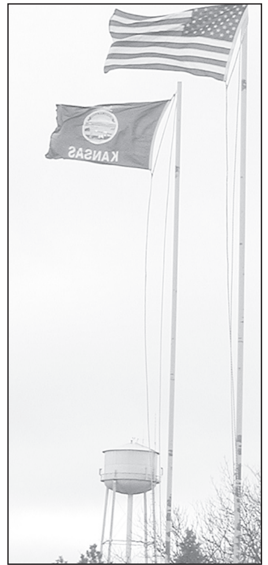
FLAGS WERE FLYING at the high school Monday afternoon.

The National Weather Service is forecasting a chance of rain and show again on Thursday and Friday.