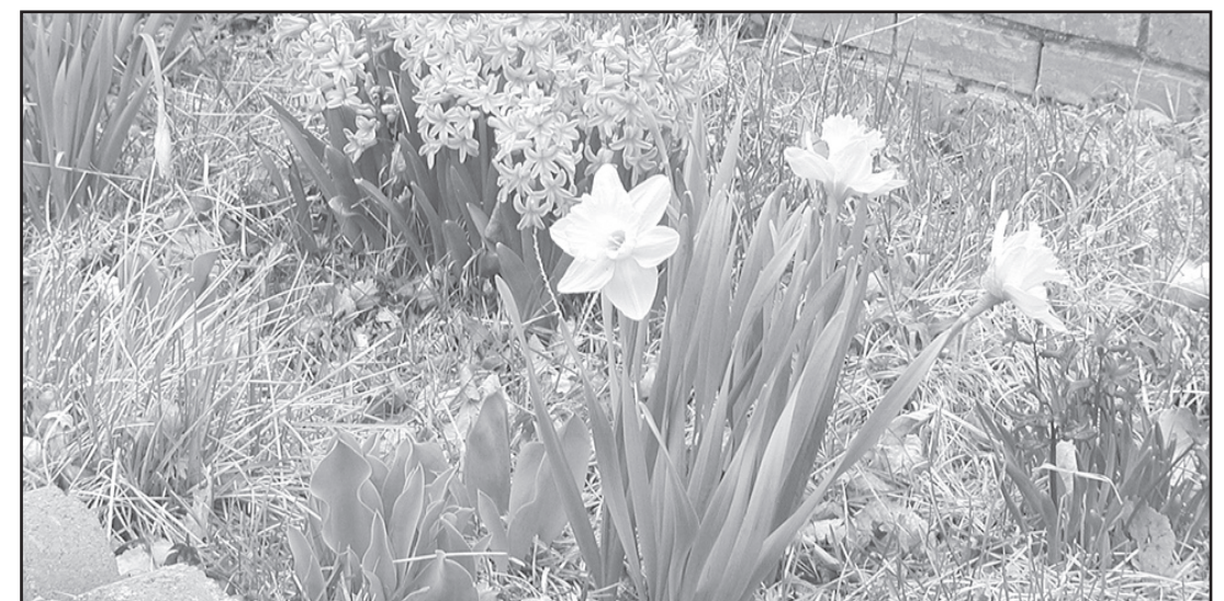
LAST WEEK, SPRING appeared to be here. The flowers pictured above were signs that warm weather had arrived. However, the flags were a sign of cold, windy weather.