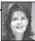
County Health Nurse

The Kansas Department of Health and Environment's Advisory Committee on Immunization Practices has come out with the new school year immunization requirements and recommendations. The regulations define immunizations required for any individual who attends school or early childhood programs operated by a school.