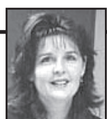
By Mila Bandel County Health Nurse