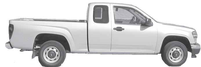
2008 Chevy Colorado, Silver, 2WD