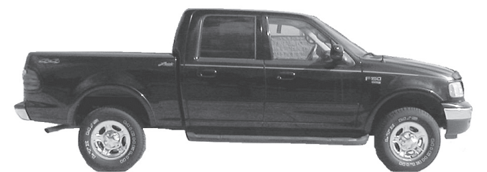
2001 Ford F150, Black, Leather, 4x4

With summer around the corner, that means yard work. At Vince's GM Center we have a few used pickups that can handle your big or small loads at great prices.