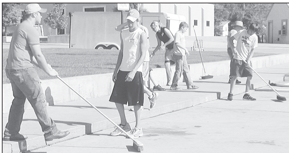
GETTING READY TO PAINT — Kids gathered at the courthouse and prepared to paint the parking lines on the street.