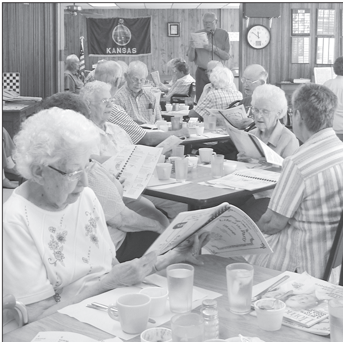
SENIOR CITIZENS sing songs before they enjoy their meal at the center.